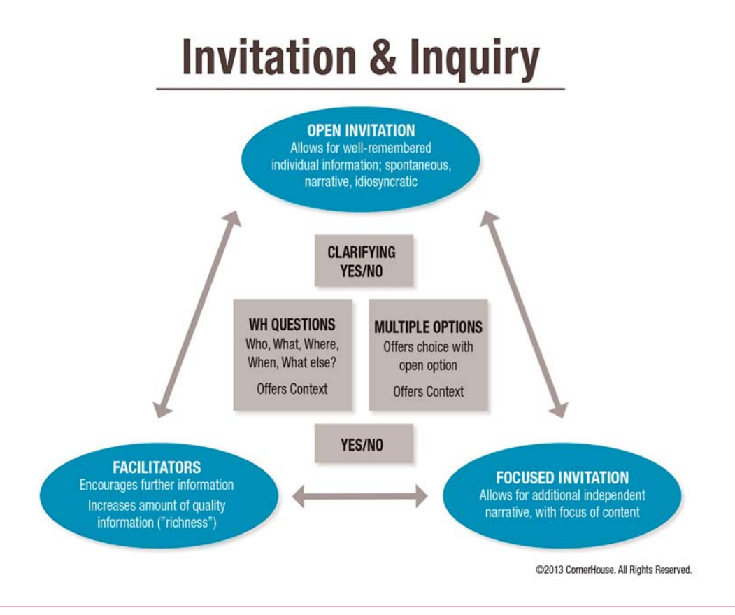
Figure 2. Invitation and Inquiry in the CornerHouse Forensic Interview Protocol

invitations made by interviewers. Invitation and Inquiry (Figure 2) emphasizes the role of the interviewer as not one who asks questions, but as a neutral fact finder who invites and allows information. Invitation and Inquiry is designed to increase the quality and quantity of information a child is able to provide. The "invitations" are encouraged and taught as preferable throughout and across interviews. Due to the specific context and focus implicit to "inquiries," interviewers are taught to use these sparingly. As has historically been true, CornerHouse training teaches interviewers to use a developmentally appropriate approach that capitalizes on the competency of each child and is more likely to yield a reliable, credible report. CornerHouse teaches the use of facilitators to invite as much narrative as possible; in particular, facilitators may be helpful with young children in meeting their developmental needs. We acknowledge that narratives may be shorter and, with some questions, beyond the developmental capacity of some young children. However, we do not teach interviewers to favor direct questions with this group or to artificially inhibit the developmental capacity of the child in the interview setting by asking direct questions. Further, any time that more direct questions are necessary, CornerHouse teaches interviewers to follow up with more indirect invitations.