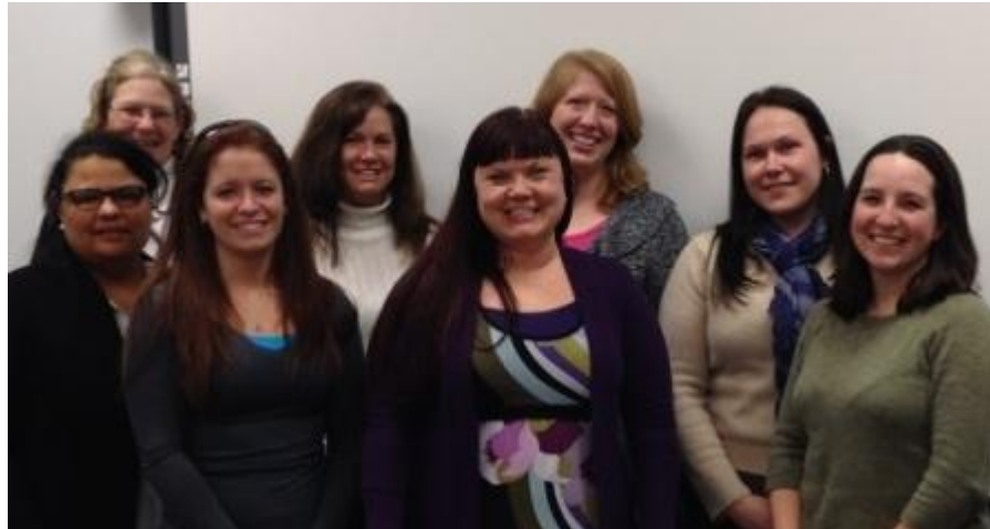
A group of learners at an On-Site Training in Dover, Delaware last week.